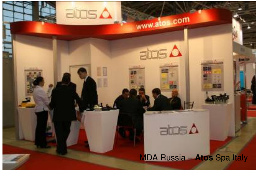
MDA Russia – Atos Spa Italy

The exhibiting companies showed their products and innovations in the fields of transmission and fluid engineering, intralogistics, industrial automation and surface technology. More than 5,000 visitors, mainly from Russia , attended the premier event to garner information about current trends and technology solutions. Around five percent of visitors were from abroad .