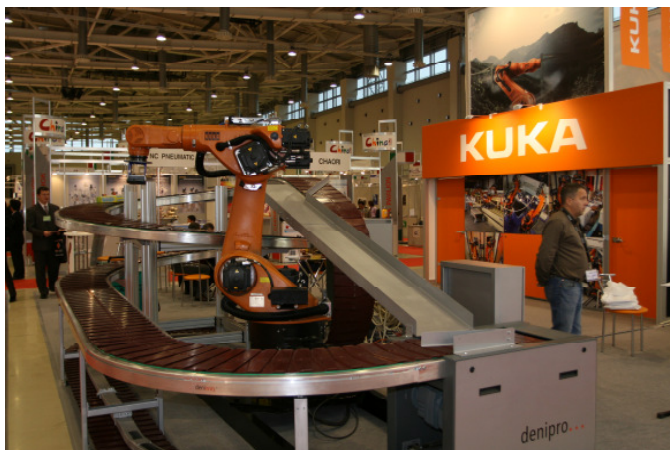
IA RUSSIA – KUKA Robotics

The event's quality was unmistakable from the very start. A new benchmark for trade show quality in Russia has been set. Deutsche Messe and ITE fulfilled their promise to offer the highest quality in the region, as exhibitors, visitors and associations all confirmed.